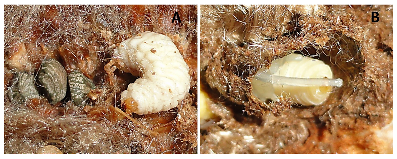
Figure 2. Loncophorus longinasus in a fruit of Pseudobombax munguba; A – Larva at the point of seed insertion; B – Pupa with long proboscis at the central seed attachment structure. This figure is in color in the electronic version.