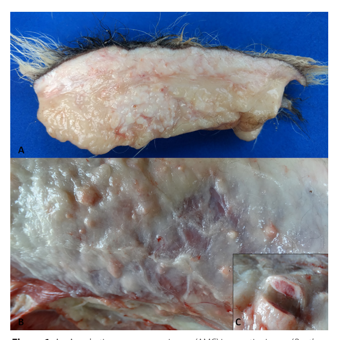
Figure 1. A – Anaplastic mammary carcinoma (AMC) in a captive jaguar ( Panthera onca ) from Manaus (Amazonas, Brazil), with neoplastic tissue extending from the superficial dermis to the subcutaneous tissue; B – Metastasis of the AMC with firm nudules in the subcutaneous tissue (thoracic and abdominal lateral region); C – Surface cut of the nodules in high magnification presenting white with reddish areas. This figure is in color in the electronic version.

A captive female jaguar, about 12 years old, from Manaus, Amazonas state, Brazil), died in its enclosure (in a private hotel mini zoo) after an 8-day history of anorexia and lethargy. The necropsy revealed a multinodular plaque into the mammary region (inguinal to abdominal direction), measuring 12.0 x 8.0 x 1.0 cm. The skin over this specific region had areas of ulceration. Through a surface cut, it was observed that the mass was extending from the superficial dermis to the subcutaneous tissue (Figure 1a). Another mass was observed adjacent to the plaque measuring 6.0 x 2.5 x 1.5 cm, being solid/firm on surface cut and diffusely white. Into the subcutaneous tissue, in several regions of the animal body, there were