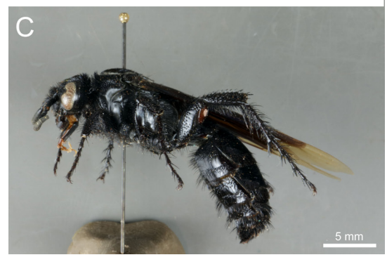
Figure 1. Stygocampsomeris manauara sp. nov. , female, holotype. A – dorsal view; B – ventral view; C – lateral view. Scale bar = 5 mm. This figure is in color in the electronic version.