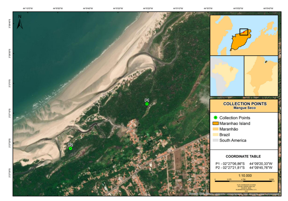
Figure 1. Location of the collection points of Laguncularia racemosa and Avicennia germinans propagules in the Mangue Seco mangrove, Ilha do Maranhão, Maranhão, Brazil. This figure is in color in the electronic version.