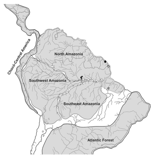
Figure 4. Continental Northern Neotropical Region (modified from Amorim 2009). Record map of Lamprempis amazonida sp. nov. Symbols represent the known collection localities as follows: solid diamond = French Guiana; open circle = Oiapock, Amapá, Brazil; solid triangle = Biological Dynamics of Forest Fragments Project (BDFFP), Manaus, Amazonas, Brazil; solid circle = ZF2 Reserve, Manaus, Amazonas, Brazil; solid star = Ducke Reserve, Manaus, Amazonas, Brazil; open star = Tucuruí, Pará, Brazil. open triangle = Serra Norte, Pará, Brazil.

Bionomy . Most specimens were collected in all months, from 1984 to 1986, in the reserves of the Biological Dynamics of Forest Fragments Project (BDFFP) (PDBFF on the labels), 100 kilometers north of Manaus, indicating a continuous annual occurrence. A few specimens were collected in the canopy, using fogging and light traps to collect high in the tropical rainforest ecosystem.