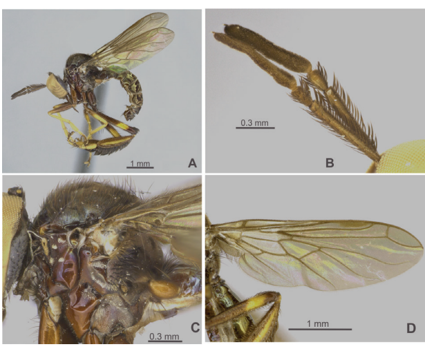
Figure 1. Lamprempis amazonida sp. nov. holotype male. A – habitus, lateral view; B – antennae, lateral view; C – thorax, lateral view; D – wing. This figure is in color in the electronic version.