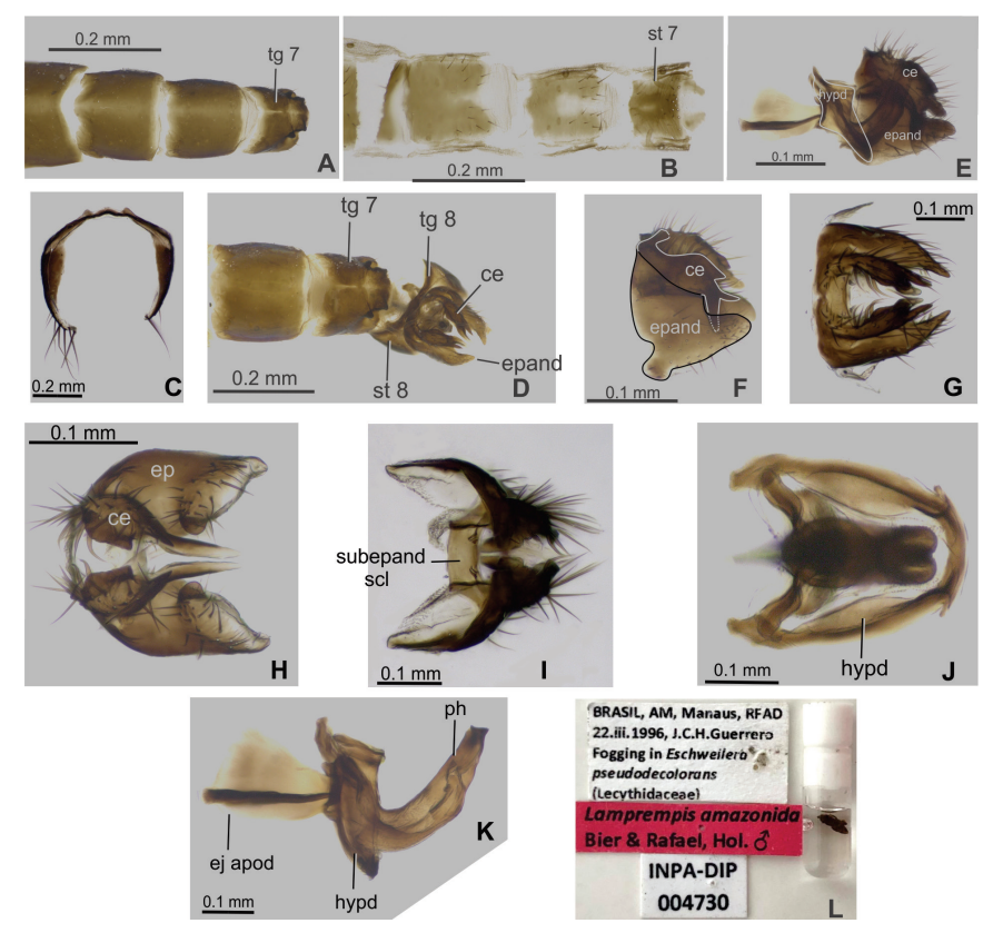
Figure 2. Lamprempis amazonida sp. nov. holotype male. A – tergites 4–7 of abdomen, dorsal view; B – sternites 4–7, ventral view; C – tergite 8, anterior view; D – apex of abdomen and terminalia, dorsal view; E – epandrium, cercus and hypandrium, lateral view; F – epandrium and cercus (detached), lateral view; G – epandrium and cercus, dorsal view; H – epandrium and cercus, ventral view; I – subepandrial sclerite, anterior view; J – hypandrium, ventral view; K – hypandrium, ejaculatory apodeme, and phallus, lateral view; L – holotype labels. Abbreviations: ce = cercus; ej apod = ejaculatory apodeme; epand = epandrium; hypd = hypandrium; st = sternite; subepand scl = subepandrial sclerite; tg = tergite. This figure is in color in the electronic version.

Paratype: Female (Figure 3). As in the male, except head dichoptic on frons; all ommatidia subequal in size; frons shiny brown to black, very small, slightly wider than high, as wide as face; hind femur with tuft of dorsal pennate setae at extreme apex and ventrally for almost entire length; hind tibia with dorsal and ventral pennate setae along entire length (Figure 3a–c). Terminalia (Figure 3g–j). Tergite 8 subtrapezoidal, darker basally, with shallow basal sinus and