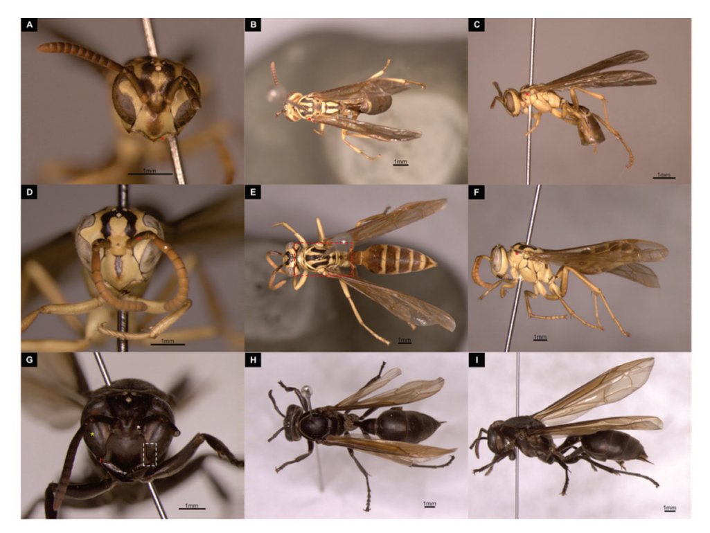
Figure 3. Frontal, dorsal and lateral view of species sampled in southeastern Acre as new records for Brazil. A-C, Agelaia baezae; D-F, Agelaia pleuralis; G-I, Polybia similima. Ventral margin of clypeus reddish tinged (A); tegula less accuted (B); pronotal keel broader (C). Antenna with scape black above, yellow beneath and pedicel and flagellum ferruginous (D); dorsum with extensive brown or black maculation (red rectangle - E); lamellate anterior margin of pronotum not markedly sinuate below fovea (F). Eyes bare, malar space very short, clypeus in contact with the eyes for a distance greater the height of antennal sockets (white rectangle - G); pronotal keel distinct on the shoulders, proeminence in front of the fovea strong but not sharp (I). Structures are indicated by asterisks. This figure is in color in the electronic version.