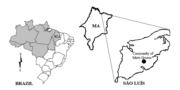
Figure 1. Map of Brazil highlighting the legal Amazon region (in gray), Maranhão state, and the location of Mato Grosso community on São Luís Island, where the study sites were located.

The pasture site (PAS) was degraded due to annual fires, and had been without grazing for the last five months preceding sampling. The pasture was a homogenous mixture of spontaneously occurring grasses and herbs (i.e., not a planted pasture), and contained isolated patches of babassu, composed by an adult palm surrounded by young (stemless) palms. We selected five such babassu patches separated from one another by distances > 100 m, and sampled soil at 0 m (i.e., within the patch), 2.5 m and 4 m distance from the patch, as composite