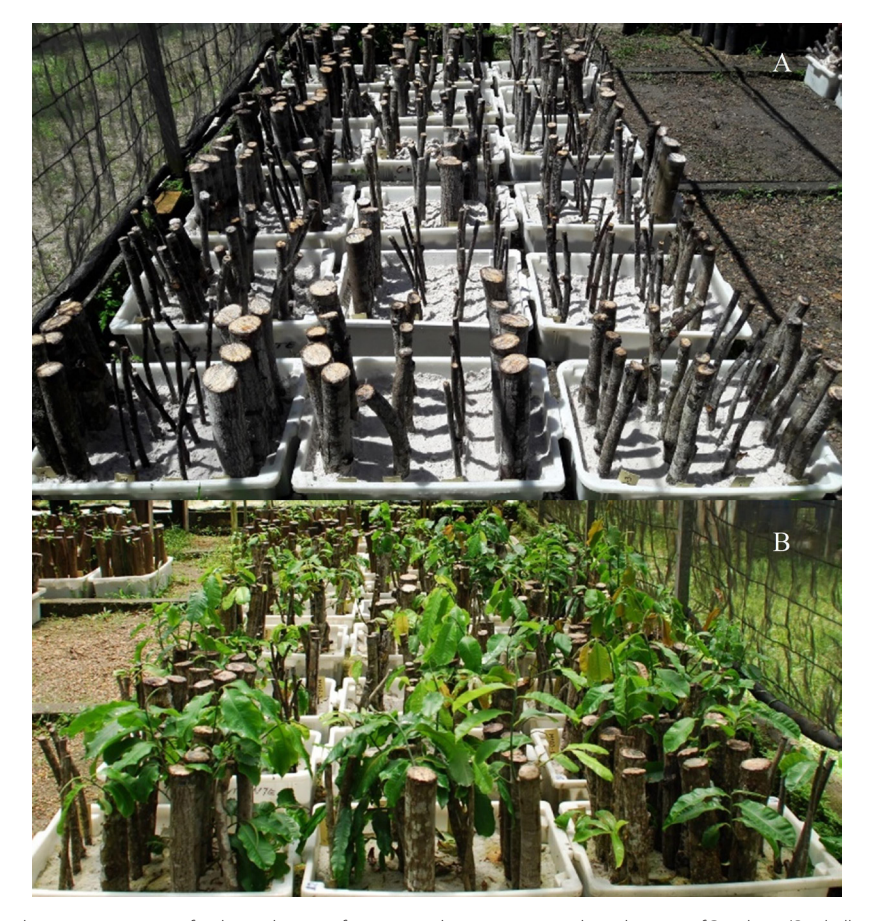
Figure 1. Images showing the experiment setup for the evaluation of epicormic shoot emission on branch stems of Brazil nut (Bertholletia excelsa) trees in seedling nursery conditions, with intermittent misting system. A – at the time of installation; B – after 48 days. This figure is in color in the electronic version.

The number of shoots was counted every five days for three months. At the end of this period, we measured the diameter and length of 20 randomly chosen shoots per mother tree and diameter catogory. For the purpose of statistical analysis, shoot counts obtained up to 45 days (average period of greatest sprout emission, Figure 1b) were considered and, from these, the sprouting speed index [adapted from Maguire (1962)] and average sprouting time [adapted from Labouriau (1983)] were calculated. The variables were square-root transformed for