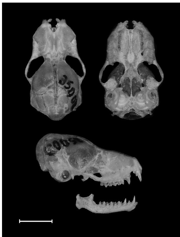
Figure 2. Dorsal, ventral and lateral views of the skull and a lateral view of the mandible of Centronycteris maximiliani (MZUSP 35003). Scale bar: 5 mm.

(Carter and Mess 2008), which according to Carter and Mess (2008) it is also found in many species of bats. The authors posit that this type of uterus presents uterine horns that join internally to form the body, which communicates with the vagina through a common cervical canal.