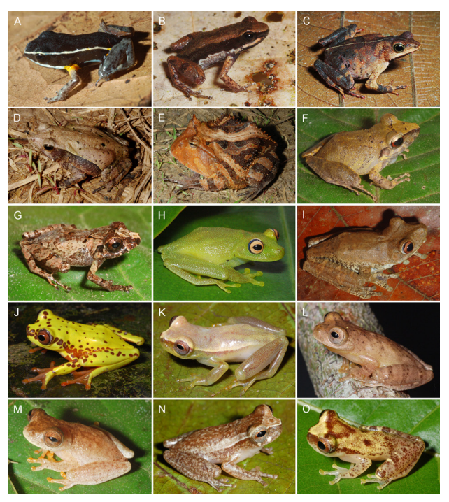
Figure 2. Photos of some of the species found in the Floresta Nacional de Pau-Rosa, municipality of Maués, state of Amazonas, Brazil. (A) Allobates femoralis, (B) Allobates masniger, (C) Amazophrynella bokermanni, (D) Rhinella gr. margaritifera, (E) Ceratophrys cornuta, (F) Pristimantis fenestratus, (G) Pristimantis sp. 1, (H), Boana cinerascens, (I), Boana wavrini, (J) Dendropsophus mapinguari, (K) Dendropsophus minuscuslus, (L) Dendropsophus minutus, (M) Dendropsophus ozzyi, (N) Dendropsophus schubarti, (O) Dendropsophus sp. 1. This figure is in color in the electronic version.