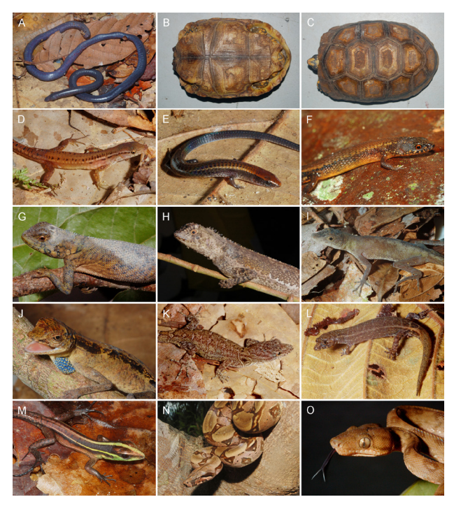
Figure 4. Photos of some of the species found in the Floresta Nacional de Pau-Rosa, municipality of Maués, state of Amazonas, Brazil. (A) Caecilia gracilis, (B) Chelonoidis denticulata in ventral view, (C) Chelonoidis denticulata in dorsal view, (D) Cercosaura sp. (E) Iphisa elegans, (F) Loxopholis osvaldoi, (G) Plica umbra, (H) Uranoscodon superciliosus, (I) Norops fuscoauratus, (J) Norops tandai, (K) Gonatodes humeralis, (L) Lepidoblepharis heyerorum, (M) Kentropyx calcarata, (N) Boa constrictor, (O) Corallus hortulanus. This figure is in color in the electronic version.