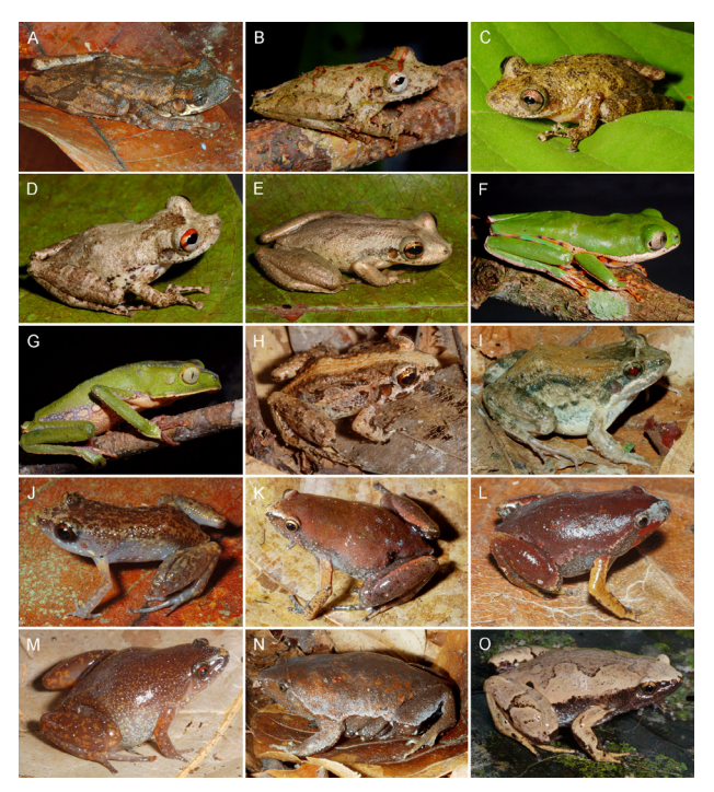
Figure 3. Photos of some of the species found in the Floresta Nacional de Pau-Rosa, municipality of Maués, state of Amazonas, Brazil. (A) Osteocephalus taurinus, (B) Scinax garbei, (C) Scinax sateremawe, (D) Scinax sp. 1, (E), Scinax sp. 2, (F) Phyllomedusa vaillanti, (G) Pithecopus hypochondrialis, (H) Adenomera sp. 1, (I) Leptodactylus petersii, (J) Phyzelaphryne miriamae, (K) Chiasmocleis avilapiresae, (L) Chiasmocleis bassleri, (M) Chiasmocleis hudsoni, (N) Ctenophryne geayi, (O) Hamptophryne boliviana. This figure is in color in the electronic version.