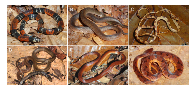
Figure 5. Photos of some of the species found in the Floresta Nacional de Pau-Rosa, municipality of Maués, state of Amazonas, Brazil. (A) Atractus elaps, (B) Erythrolamprus oligolepis, (C) Imantodes lentiferus, (D) Taeniophalus occiptalis, (E) Tantilla melanocephala, (F) Xenopholis scalaris. This figure is in color in the electronic version.