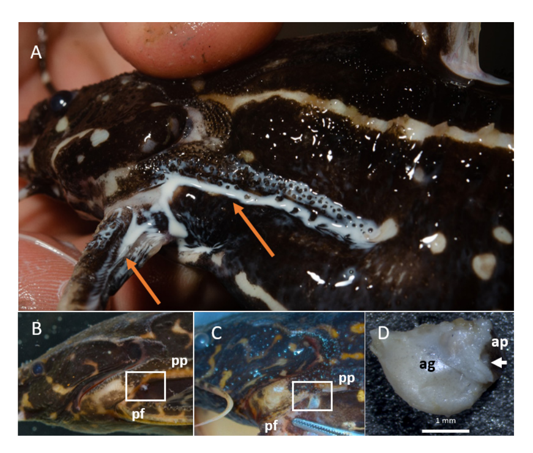
Figure 1. A – Acanthodoras spinosissimus secreting the milky putative poison (arrows); B – Axillary pore (rectangle) of A. spinosissimus , located below the postcleithral process (pp), near the base of the pectoral fin (pf). C – Opened pore (rectangle); D – Axillary gland of a specimen of A. spinosissimus of 90 mm standard length, indicating the position of the axillary pore. pp = postcleithral process; pf = pectoral fin; ag = axillary gland; ap = axillary pore. This figure is in color in the electronic version.