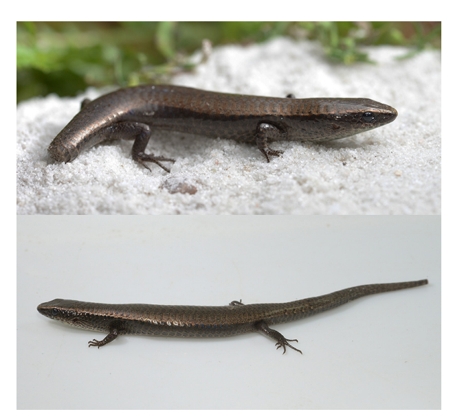
Figure 2. Specimens of Gymnophthalmus underwoodi from Belém, Pará, Brazil [MPEG 33157 (top) and MPEG 33158 (bottom)]. This figure is in color in the digital version.

and substitution models was chosen using PartitionFinder version 2 (Lanfear et al. 2017) in version 3.3 of the CIPRES web portal (Miller et al. 2010). For the phylogenetic positioning of our samples, we ran a maximum likelihood analysis in RAxML version 8 (Stamatakis 2014) using version 3.3 of the CIPRES web portal (Miller et al. 2010). The bootstrap analysis was implemented with 1000 pseudoreplicates. Finally, the bipartition support was drawn on the best likelihood tree.