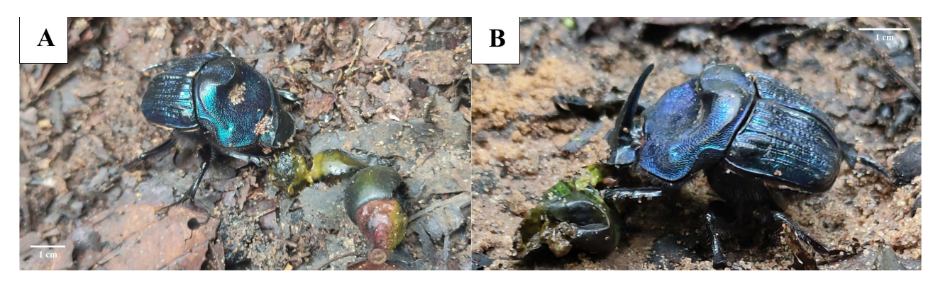
Figure 2. A,B – Two individuals of Coprophanaeus lancifer consuming ripe Nectandra sp. fruits at Los Amigos Biological Station, Peru. This figure is in color in the electronic version.