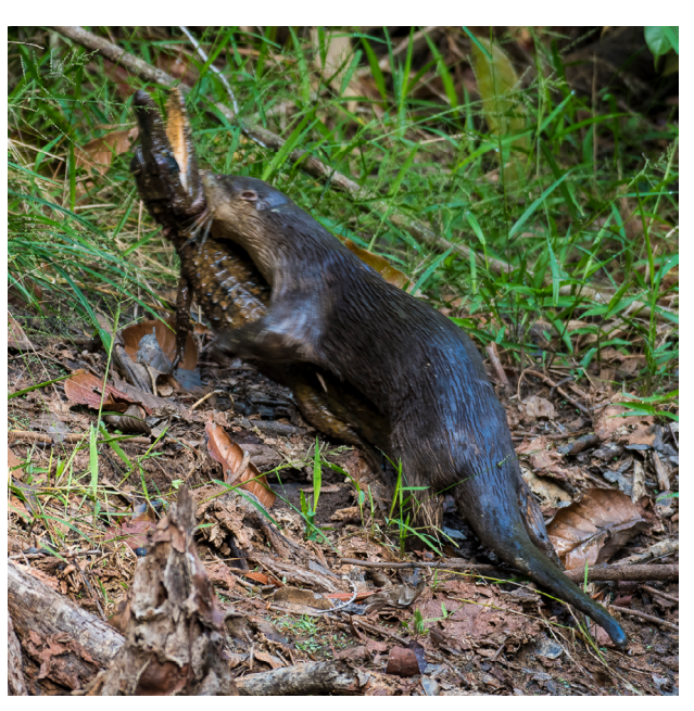
Figure 3. Adult individual of Lontra longicaudis carrying a predated subadult Paleosuchus trigonatus out of the stream into the riparian forest in the municipality of Tefé, Amazonas state, Brazil.

More recent research has suggested that this dense ossification may actually be an adaptation of dwarf crocodilian species to equatorial environments, functioning mainly as a calcium reserve and for thermoregulation (Clarac et al. 2024).