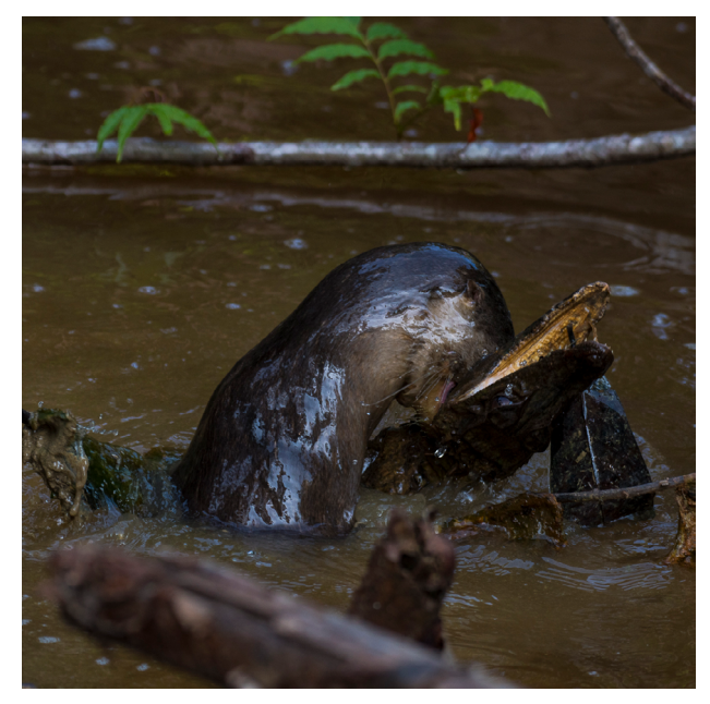
Figure 2. Adult individual of Lontra longicaudis attacking a subadult Paleosuchus trigonatus in a stream in the municipality of Tefé, Amazonas state, Brazil.

Forsberg 2014). The stream where the predation occurred was shallow and narrow during the dry season, in addition to being approximately 8 km away from the largest water body (Tefé lake), which may have reduced the abundance of larger fish. Changes in the water level of streams also influence niche partitioning by some species of predators, as reported for P. palpebrosus and P. trigonatus by Marioni et al (2022). With the reduction in water level of the stream, L.longicaudis , besides having fewer prey options, probably had increased home-range overlap with P.trigonatus (Magnusson and Lima 1991; Marioni et al. 2022), increasing the chance of interspecific interactions.